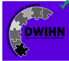
Grayscale Logo on dark Background